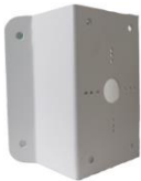
DS-1276ZJ-Y Wall Mount